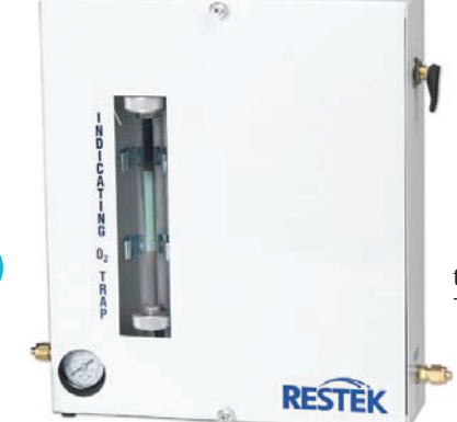
Dimensions: 12" x 14" x 3" (30.5 x 35.6 x 7.6 cm)